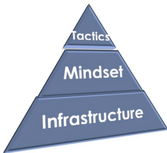
Figure 2: A model (under development) representing the Berkeley Method of Entrepreneurship.